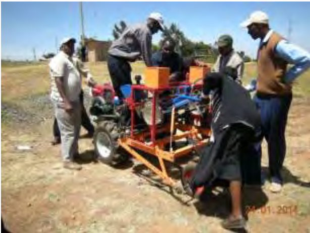
Assembling the Gongli Africa seed drill

2BFG 100 Chinese rotary tillage seed drill. 2BG-6A Chinese rotary tillage seed drill Dong Feng standard 80 cm rotavator Kenyan made 2WT one tonne trailer. KENDAT made trailing boom spray for 2WT.