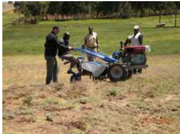
Driving instruction with the Dong Feng rotavator