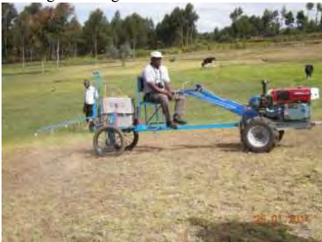
The KENDAT 2WT sprayer