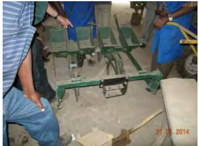
Examination of the Intermech/Morrison seed drill