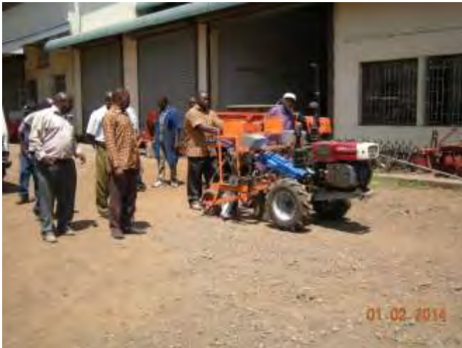
Calibrating the Gongli Africa seed drill

We therefore did extensive testing and demonstration on the Gongli Africa unit, as well as the Intermech/Morrison hybrid seed drill which was partly developed at CAMARTEC. A 2WT Nandra seed drill, made in Moshi, Tanzania was also inspected although not tested in the field.