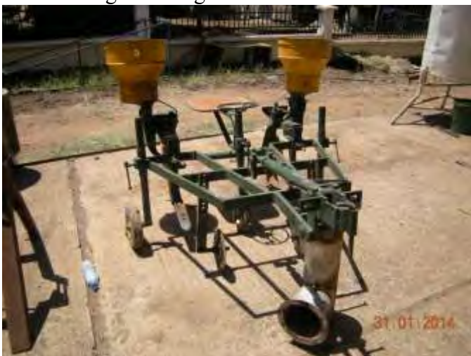
The Nandra 2 row 2WT seed drill