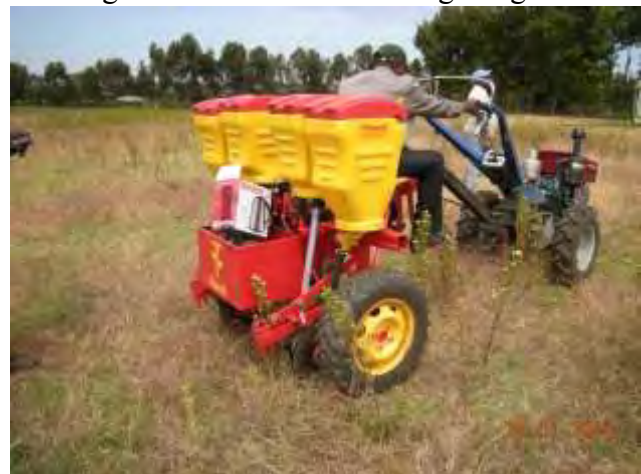
Testing the Fitarelli 2 row seed drill