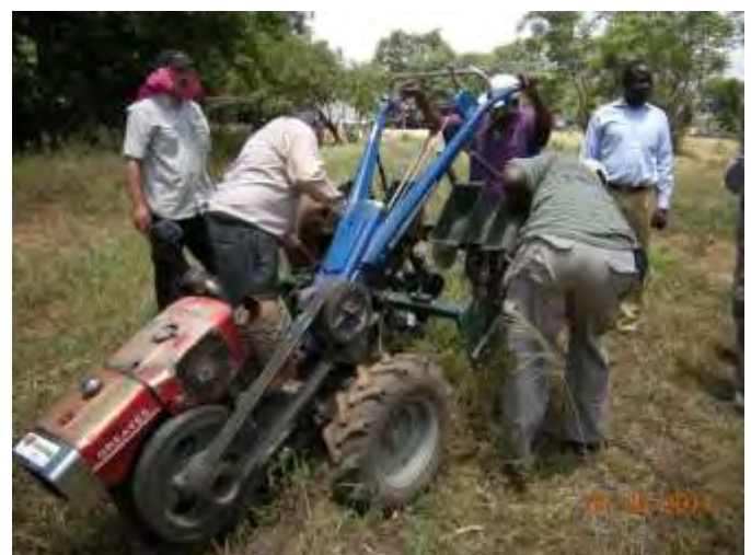
Field adjustments on the Intermech/Morrison drill

There were 15 delegates at the Kenyan module, and 12 at the Tanzanian component. At both trainings those with previous experience with 2WT operation were the most knowledgeable, asking many questions. On days two and three there were plenty of questions and much discussion on the maintenance and operation of these farm implements.