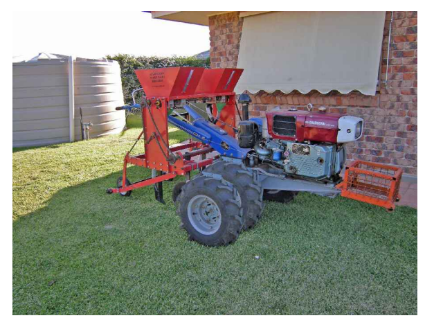
2WT with dual drive wheels (Photoshop impression)